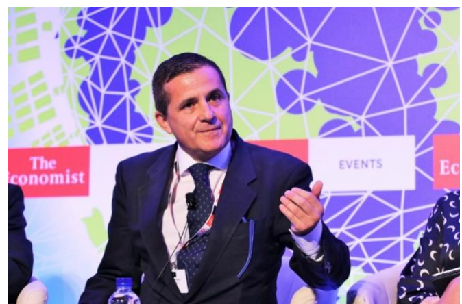
Konstsantinos Aravossis, general secretary, natural environment and water of the Ministry of Environment and Energy of Greece.

The dialogue on sustainability transition necessarily included a session on Sustainable finance , another crucial field of action with a potential that has been analyzed in detail by Masamichi Kono , deputy secretary-general of OECD, and that involves green bonds, environmental, social and governance (ESG) factors and socially responsible investing (SRI).