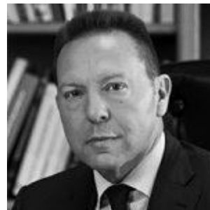
Yannis Stournaras Governor, Bank of Greece