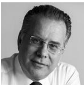
George Koumoutsakos Alternate minister for immigration policy, Ministry of Citizens' Protection, Greece