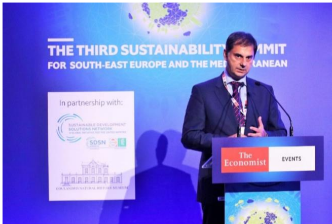
Harry Theoharis, minister of tourism of Greece, during his speech.

The discussion then focused on Blue economy and circular economy and on the potential of Greece as a leading country in Mediterranean blue economic growth. Harry Theoharis , minister of tourism of Greece, emphasized the role of incentives to improve sustainability in tourism, especially along Greek coasts. As reported by The Economist Events for Greece, Cyprus, Malta and south-eastern Europe , Socrates Famellos , former alternate minister of environment and energy, referred to the National Strategy for Circular Economy as a strategic tool to achieve blue economy and circularity objectives, while stressing the need for finalization of regional climate change adaptation plans in most regions.