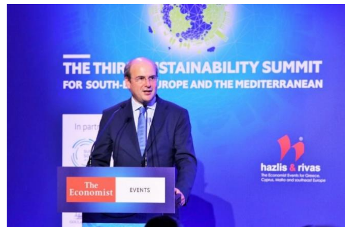
Kostis Hatzidakis, minister of environment and energy, Greece, during his keynote address.