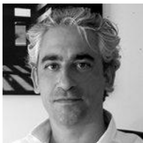
Spyros Kouvelis President, Greek Eurasian Business Council, former vice-minister for foreign economic, cultural and environmental affairs, Greece