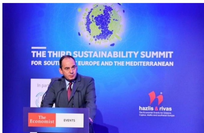
Ioannis Plakiotakis, minister of Maritime and Island Policy of Greece giving his speech on Green-blue shipping and sustainable marine resources management.

As pointed out in the discussion on Technology and innovation , the whole business sphere has been