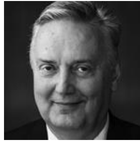
Zlatko Lagumdžija Former prime minister, Bosnia and Herzegovina