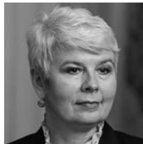
Jadranka Kosor Former prime minister, Croatia