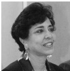
Assia Bensalah Alaoui

Commissioner for migration, home affairs and citizenship, European Commission