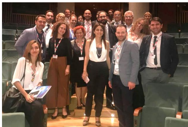
The team of UN SDSN Greece at the launch of the Euro-Asian UN SDSN initiative "Sustainable Development in the Four Seas Initiative: the Mediterranean, the Black Sea, the Caspian Sea and the Aral Sea"

On behalf UN Sustainable Development Solutions Network Greece and EIT Climate-KIC Hub Greece we are deeply grateful to all the speakers for contributing to the Sustainability Summit, making it the focal meeting on sustainability leadership in academia, politics, business and civil society in South East Europe and the Mediterranean. Namely, we would like to thank: