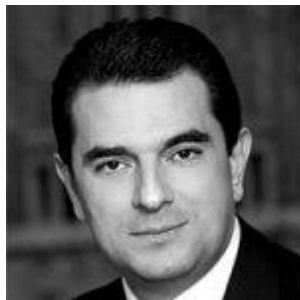
Kostas Skrekas Deputy minister, Ministry of Rural Development and Food, Greece