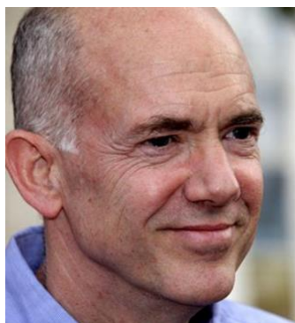
Prof. Andreas Papandreou